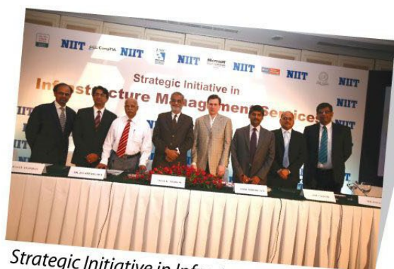
Strategic Initiative in Infrastructure Management Services