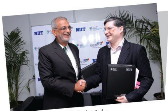
NIIT Yuva Jyoti – Skills for jobs