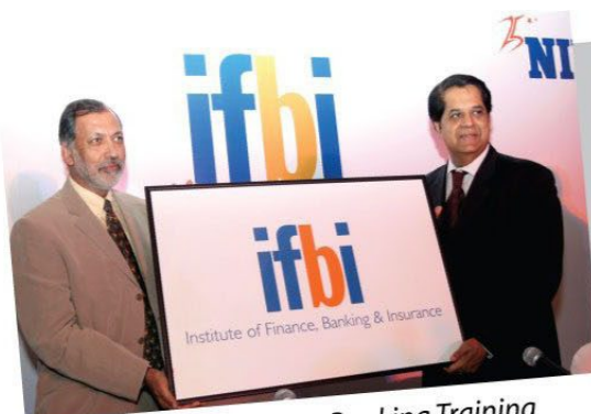
NIIT IFBI – India's largest Banking Training Institute