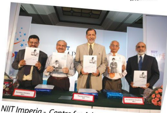
NIIT Imperia - Centre for Advanced Learning