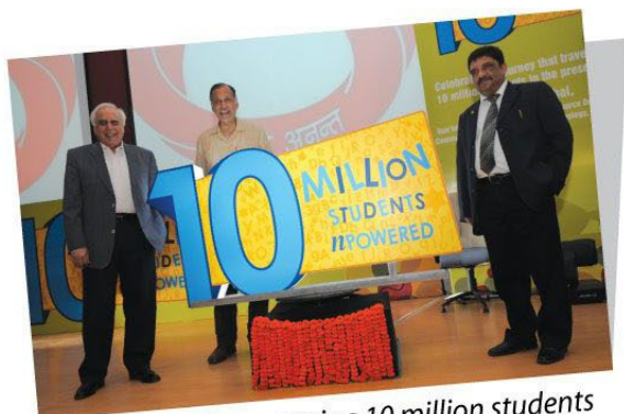
NIIT Nguru – Empowering 10 million students