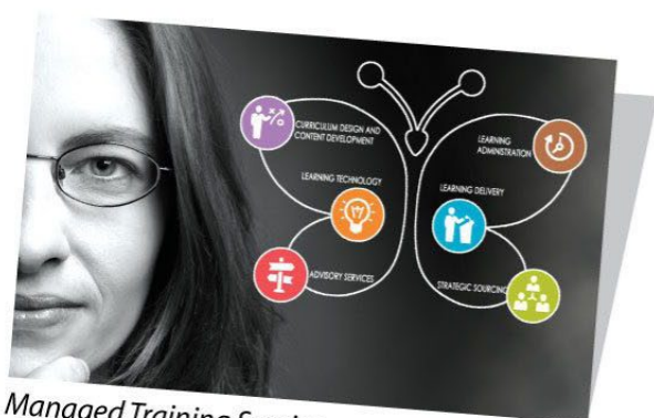
Managed Training Services