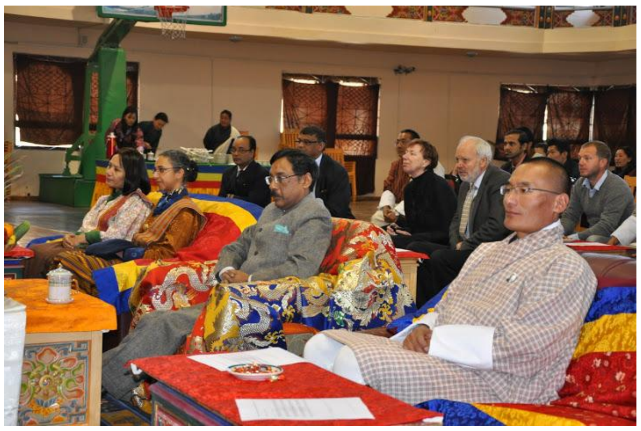
Launch of Youth Training Project in the presence of Indian Ambassador