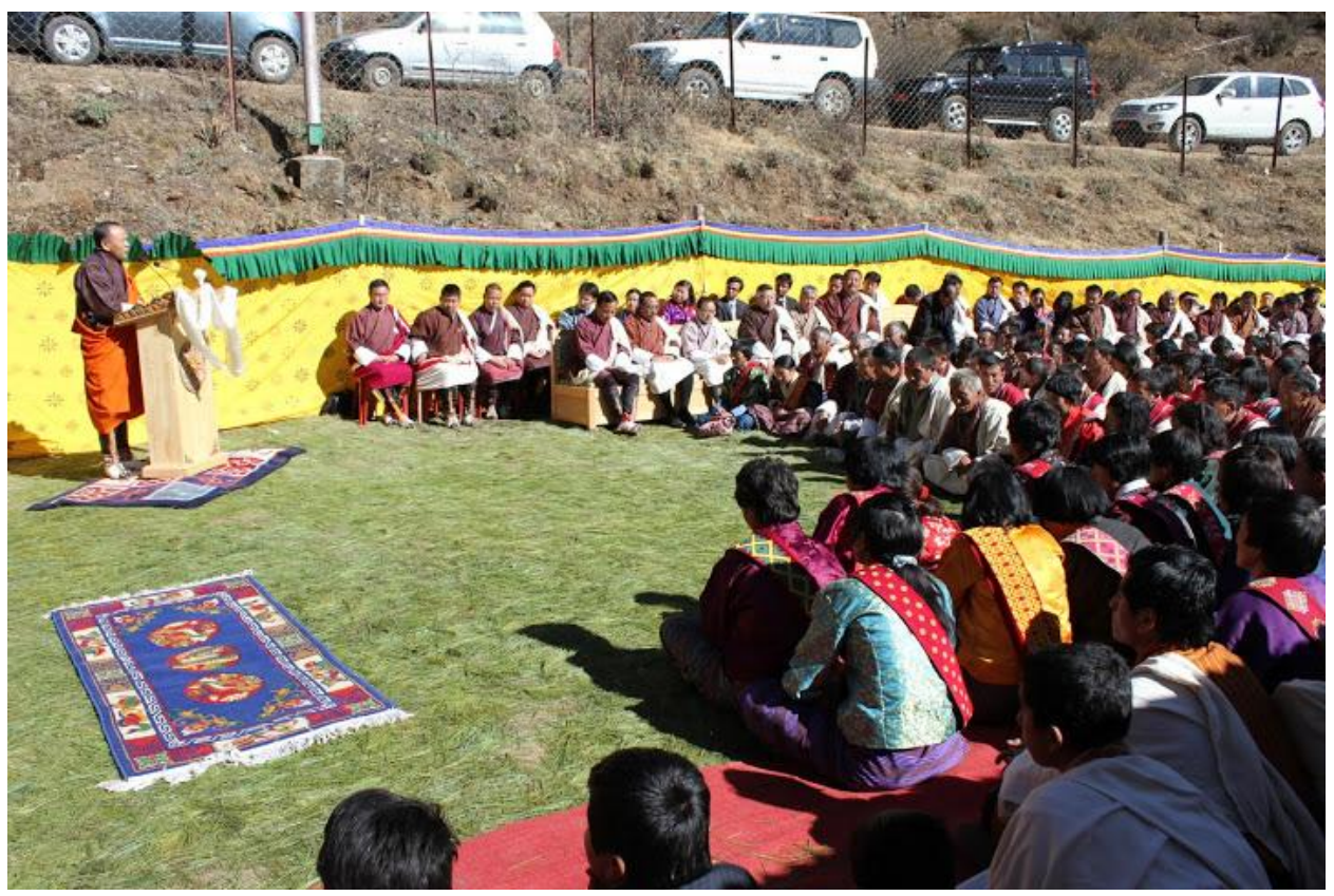
Launch of HiWEL Project