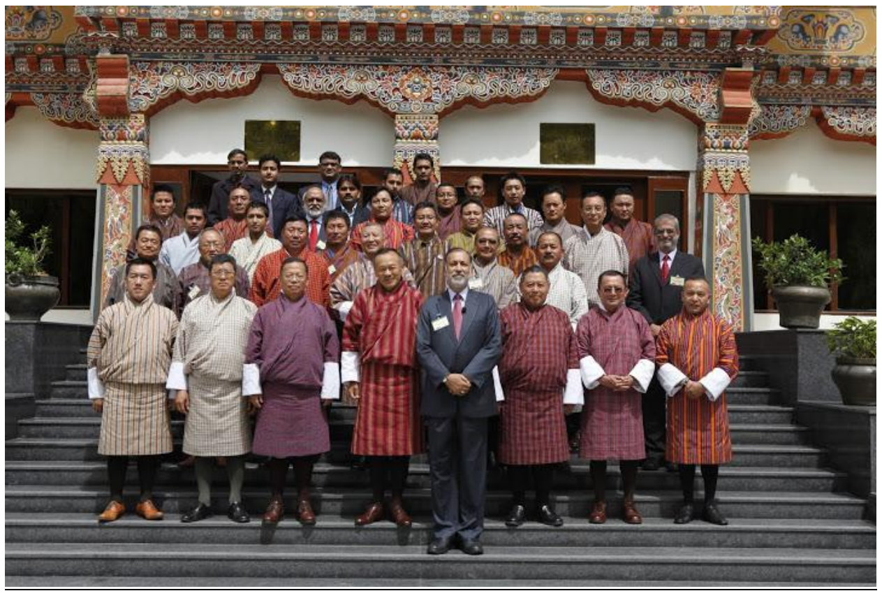
NIIT Team with Prime Minister and his entire Cabinet after successful completion of their training