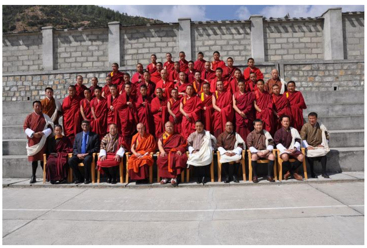
Launch of Training Project for Monks