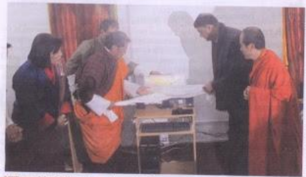
ICT-enabled Education: The agriculture minister and education secretary at the inaugural ceremony held at Jakar school