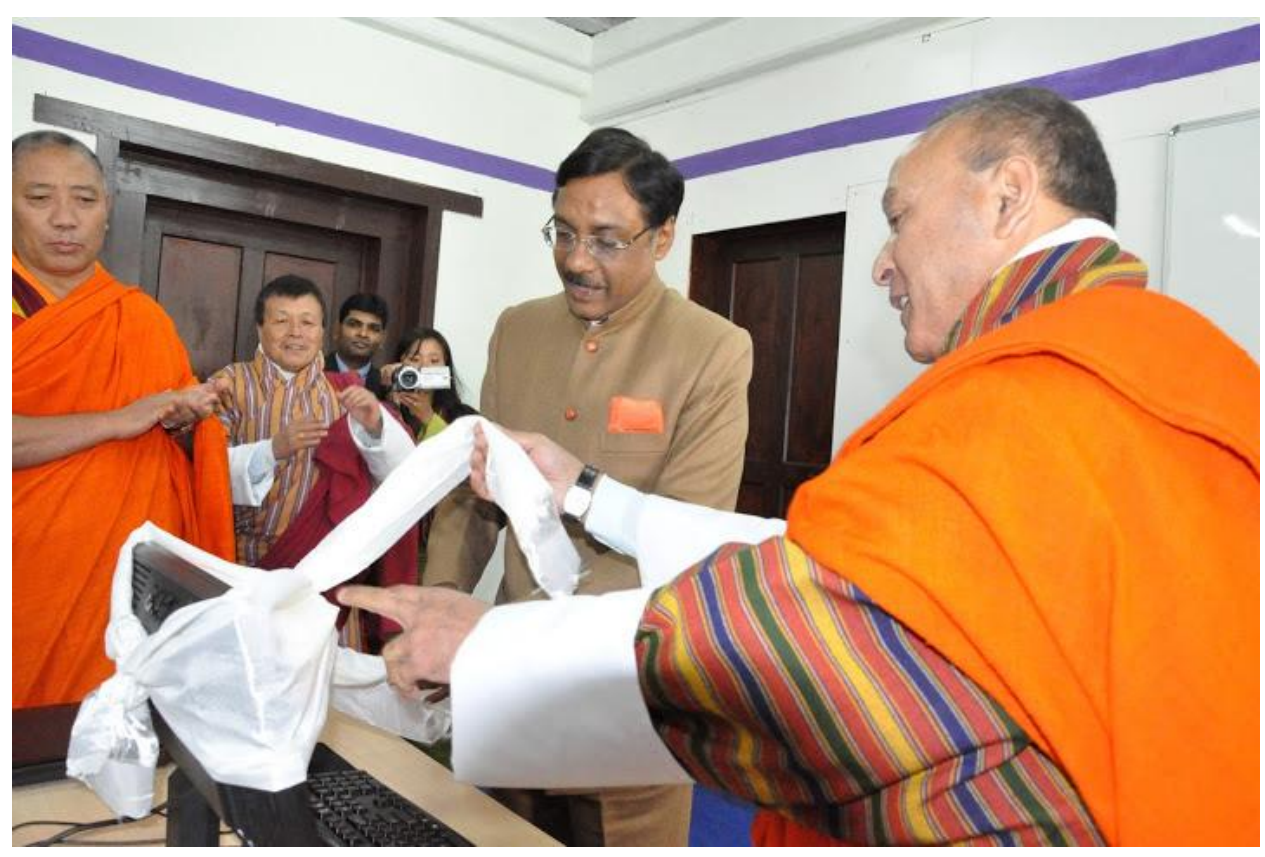
Launch of Teacher Training Project by Indian Ambassador