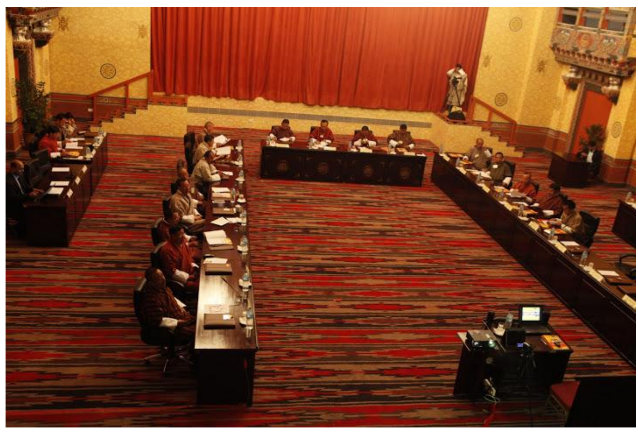
Training of Cabinet Ministers in Progress