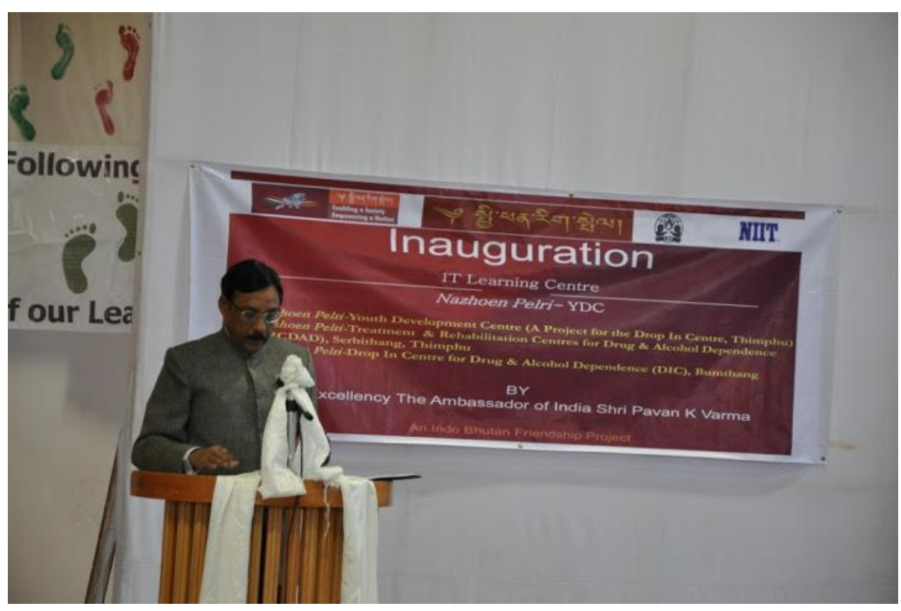
Launch of Youth Training Project by Indian Ambassador