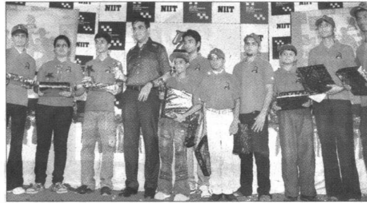
■ Grandmaster Viswanathan Anand with the winners of NIIT Mind Champions Academy—Chess Master 2011, in Patna on Friday.

"It is within the reach of all," Modi said, while thanking NIIT for their pioneering effort in promoting the game in the backwaters of Bihar. He also