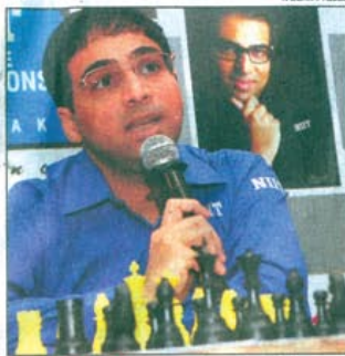
MASTER SPEAKS: Viswanathan Anand

On India missing out on the WCC event: A player should be ready to play chess anywhere in the world. It is up to the chess body