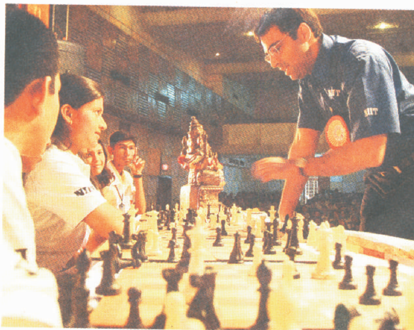
World champion Viswanathan Anand at Chess Master 2008 in Pune