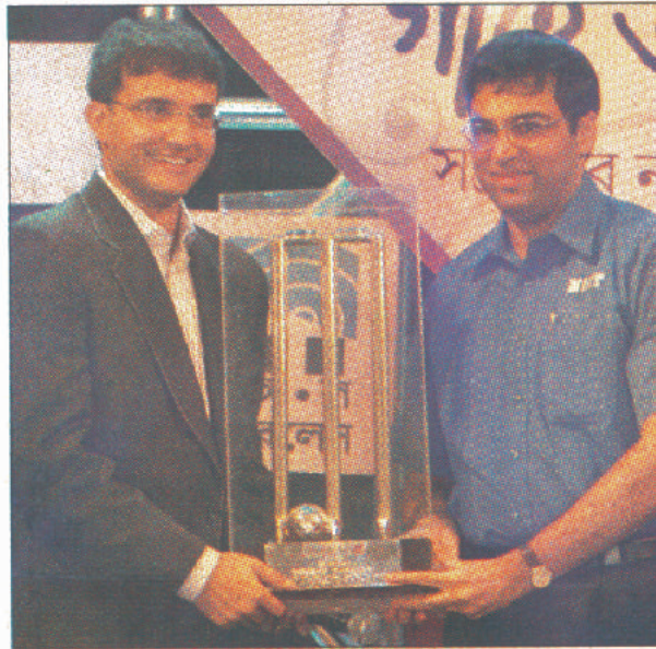
Sourav Ganguly (left) and Viswanathan Anand during a felicitation ceremony in Kolkata on Thursday.