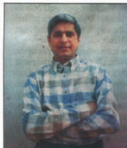
Swarup's second novel Six Suspects hit the stands last July

"That got me fascinated and I realised that there's an innate ability in everyone to do something extraordinary, provided they are given an opportunity. How else do you explain children with no education at all being able to learn to use the Internet. This shows knowledge is not just the preserve of the elite," Swarup said, while talking about the project, in which NIIT chief scien-