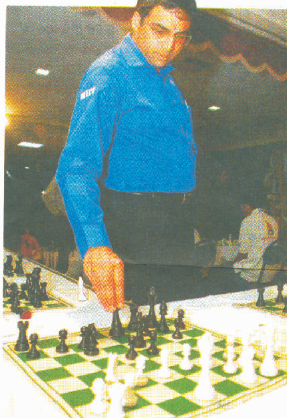
Viswanathan Anand in Jaipur on Friday

Elaborating more on attracting people towards the