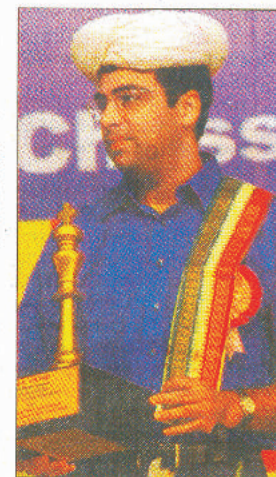
of the same strength as 2750 twenty years back."

"I'm personally worried about the inflation of the rupee! On a serious note, this inflation in rating is quite normal. Probably, Elo 2850 today is