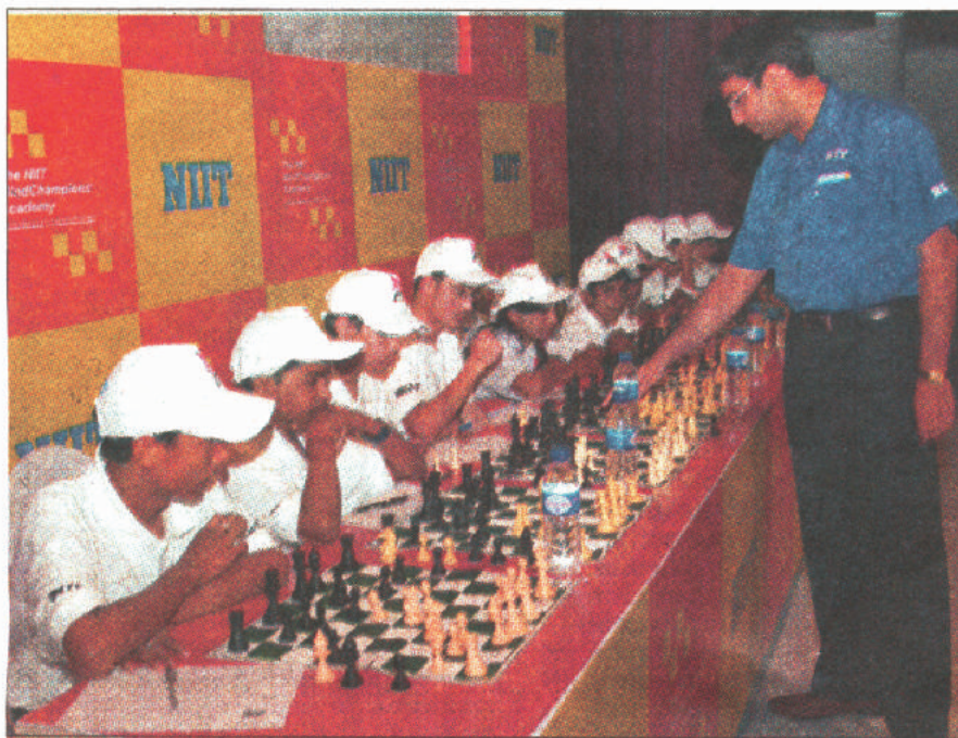
World Chess Champion Viswanathan Anand playing with the winners of NIIT's Chess Master, 2008, East Zone during a felicitation function in Guwahati on Wednesday.