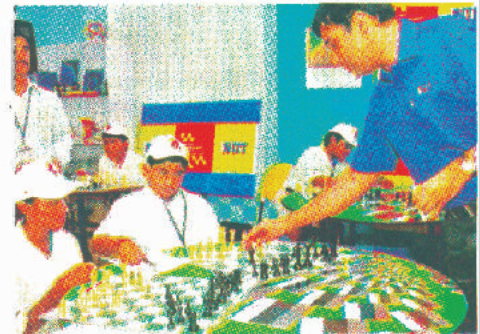
World champion Viswanathan Anand plays with young champions in Chennai on Monday

"Also, it is heartening to see that the NIIT Mind Champions Academy has reached a huge number of children across the country to initiate them to chess. This is a good sign for the game's development in the country and hopefully India will become all the more powerful in chess," he said.