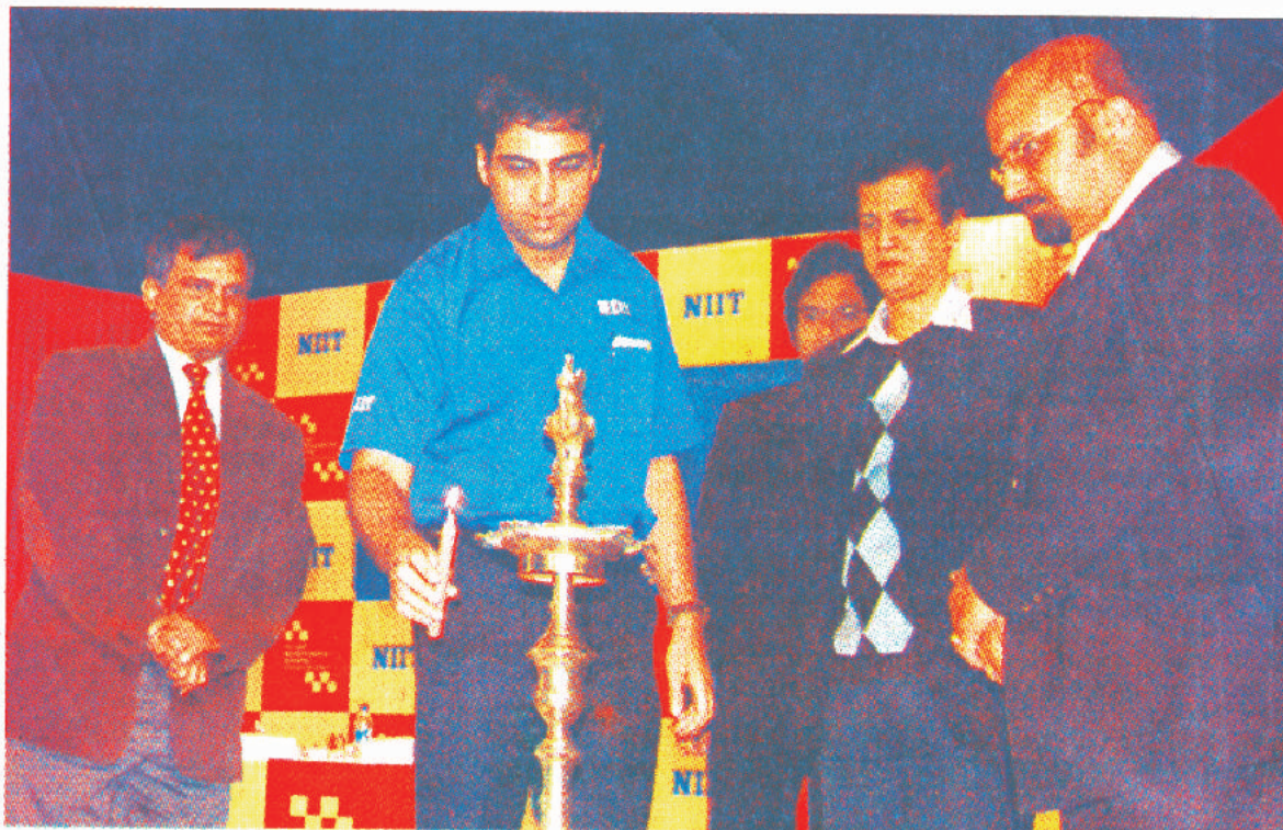
World Chess Champion Viswanathan Anand inaugurating the NIIT's Chess Master 2008 East Zone winners felicitation programme at Pragjyoti ITA Centre for Performing Art in Guwahati on Wednesday.

"One can learn a lot from him. I hope he comes here again in future that will inspire the present generation." Ganguly also spoke about his retirement and said he felt it wise before he was being pushed out. "It's a tough decision... But it's important to strike a balance between going out and being pushed out... I thought the time had come for me to retire. (PTI)