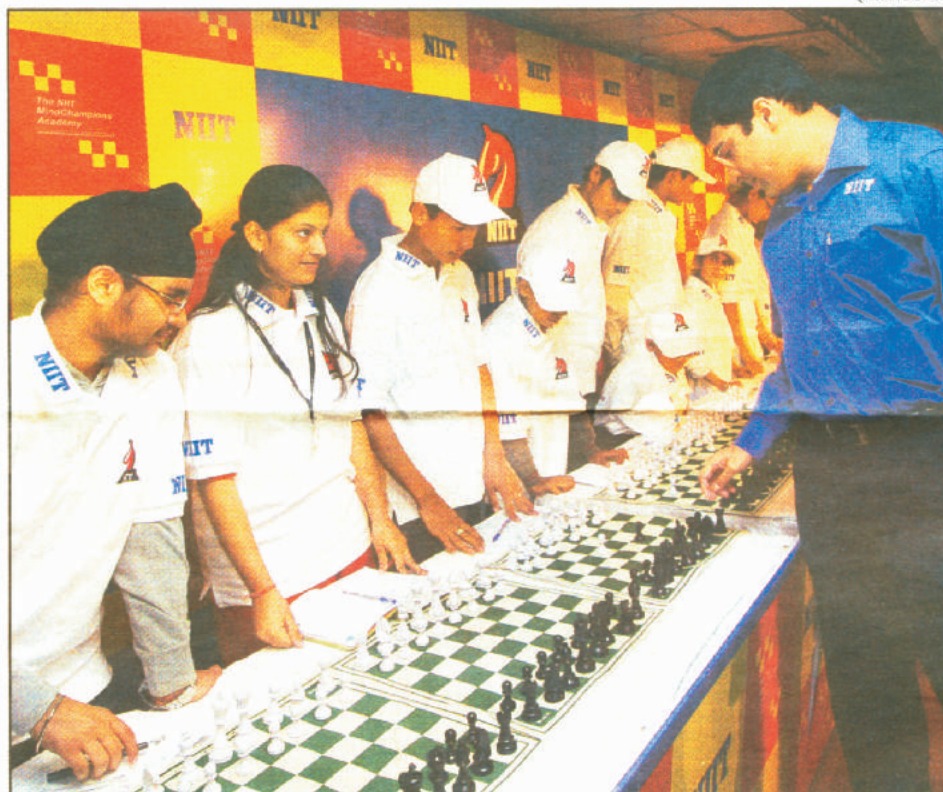
Viswanathan Anand plays with young fans at a promotional meet in New Delhi on Saturday

Interestingly, Anand had talked about getting top level tournaments to India after his win at the World Championship