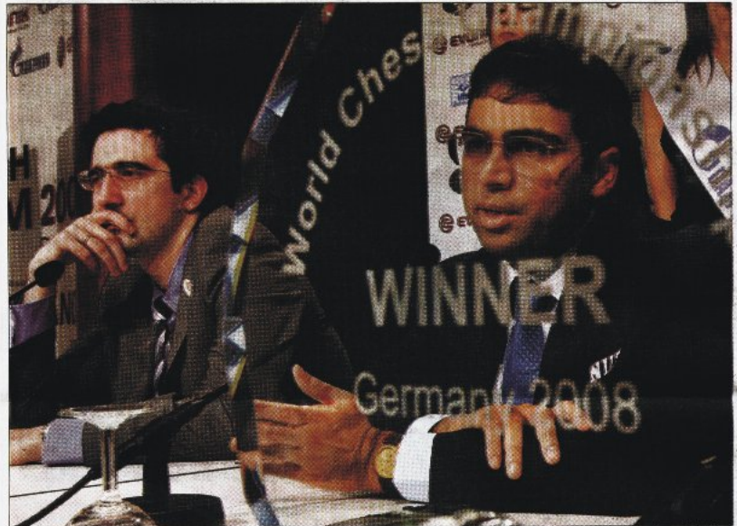
Anand (right) and Kramnik at the post-match news conference in Bonn on Wednesday.