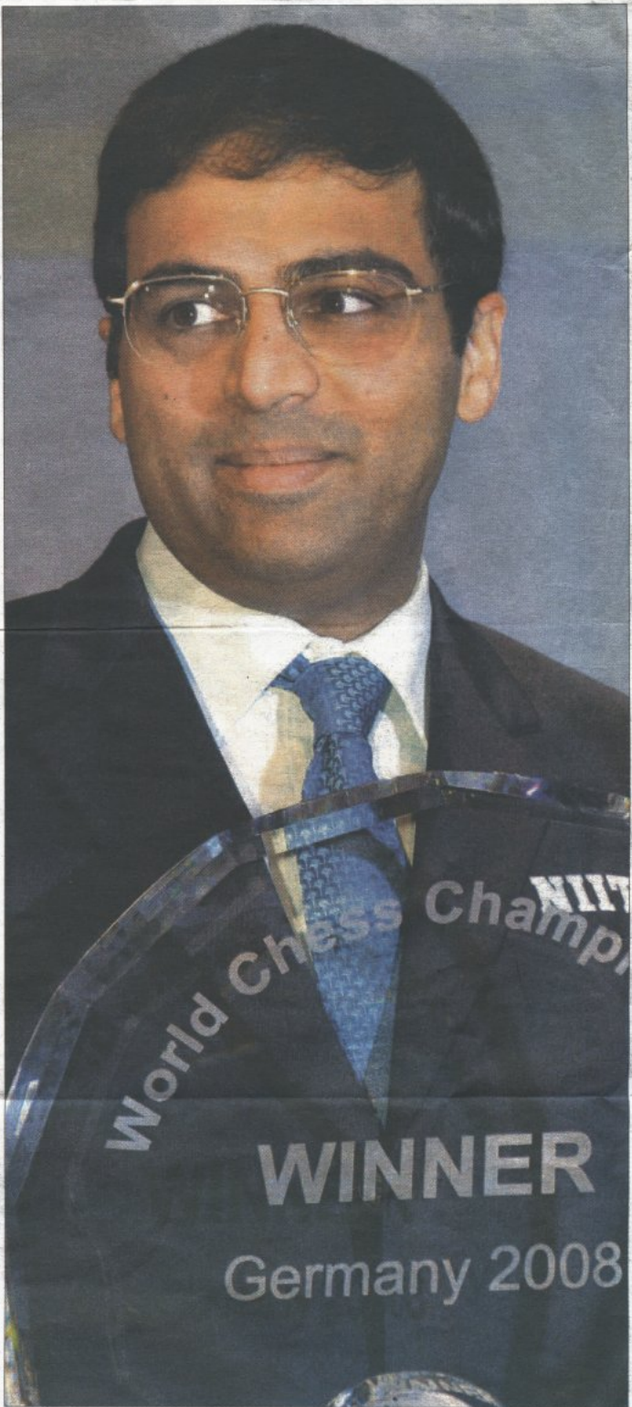
Viswanathan Anand celebrates winning the Chess World Championship after the 11th game against Russia's Vladimir Kramnik in the Art and Exhibition Hall in Bonn, Germany on Wednesday.