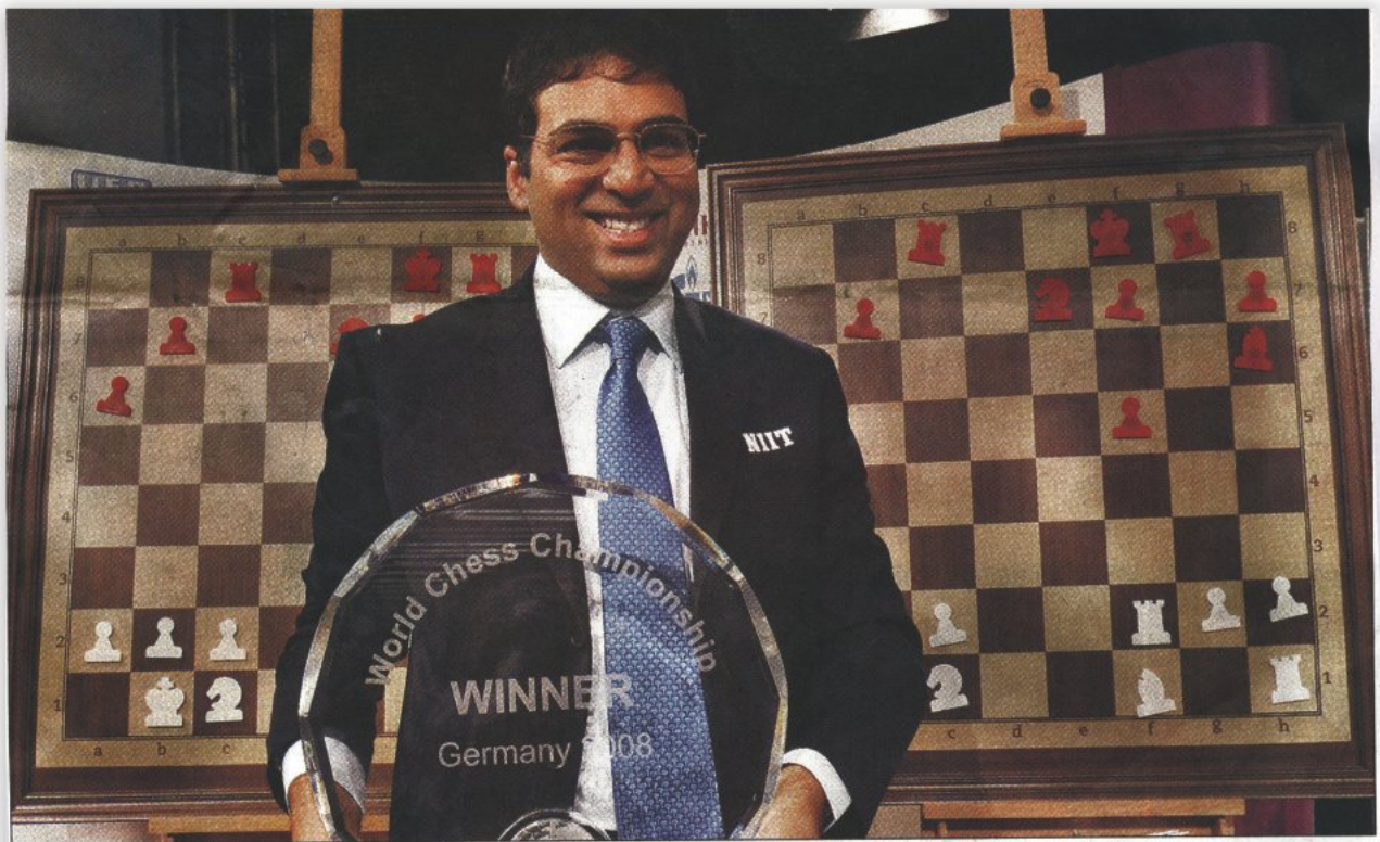
BONN IDENTITY: Viswanathan Anand holds the winner's trophy after clinching the Chess World Championships in Bonn. Anand played a draw in the 11th game on Wednesday to retain his title with a 6.5-4.5 points victory over challenger Vladimir Kramnik of Russia.

Hindustan Times New Delhi, October 30, 2008