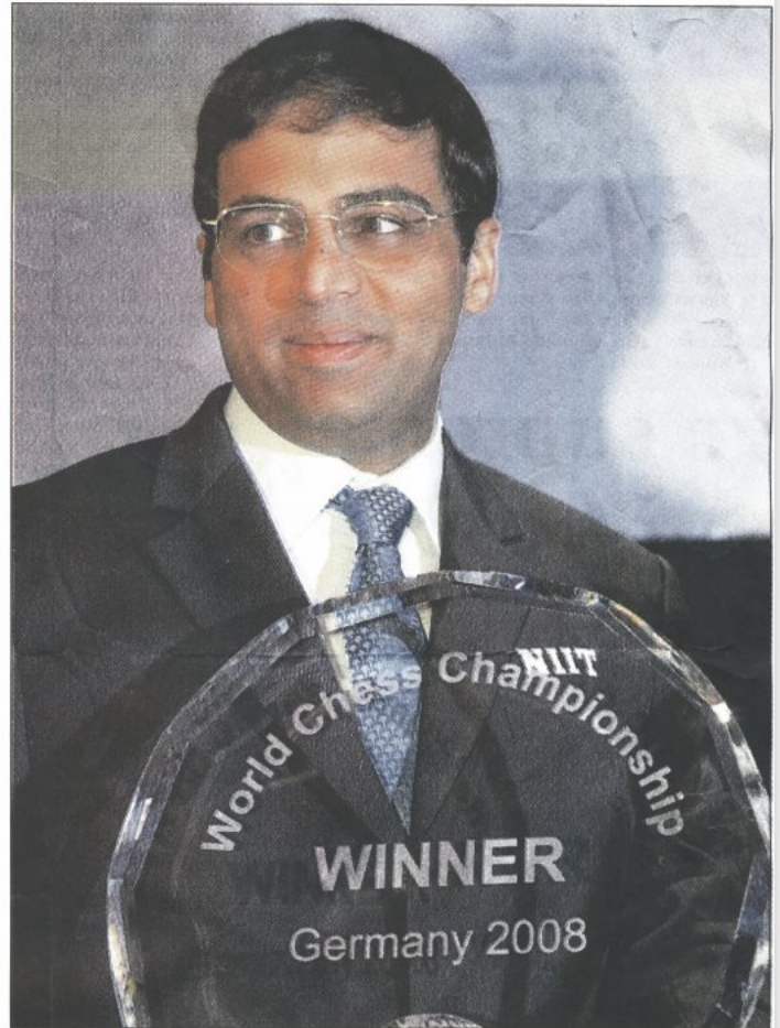
India's Vishwanathan Anand poses with the Chess World Championship trophy in the Art and Exhibition Hall, Bonn, on Wednesday. Anand beat Russia's Kramnik.

Anand had already won the World Blitz and World Rapid titles also in the past, besides the World classical title in three different formats.