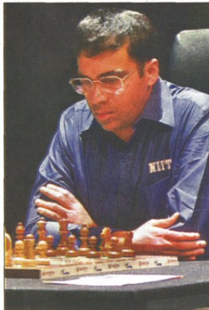
Anand: A big step towards winning the big one

The players almost blitzed the first 15 moves and Kramnik must have been encouraged by the fact that post-game analysis after Anand's victory in the third game suggested that white was in fact better in the middle game.