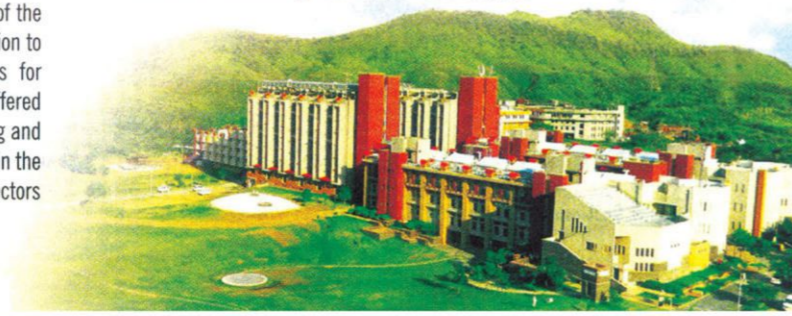
India Today National, November 26, 2018

NU is dedicated towards forging strong industry linkages as one of its core principles. This ensures that the University is connected with the best organisations and institutions, in India and globally. The Centre for Industry Collaboration (CIC) assists students in their endeavours to enrich their education, careers and lives and make lifelong contributions to society. NU has achieved 100% undergraduate placement last year.