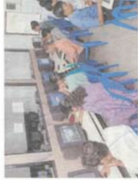
An NIIT education centre in Chennai.

"Prices are very competitive in Africa as the affordability factor is not very high, translating into slender margins. Demand is purely the driver," he said. Moreover, for better job prospects outside of the continent, people realise the