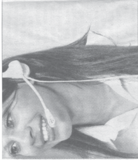
UNDERSTAFFED: In two to three years, India will require close to 1.4 million people for the IT and BPO sector

He added that the centres would spread to smaller locations in the second phase. "The industry requires 1.4 million people in the next two to three years. Our institute will cater to 15 to 20 per cent of the workforce. Next year, we will