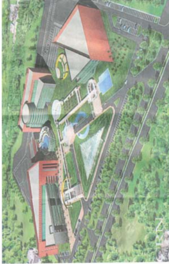
NIIT's proposed Greater Noida campus, where sixty per cent of the total 25 acres have been earmarked for greenery.

"At NIIT, we have started buying from vendors who sell products with Green tags. These products are a little costly, but considering the advantages, we don't mind shelling out the extra bucks. We ask for equipment that have a good Green rating, because they are