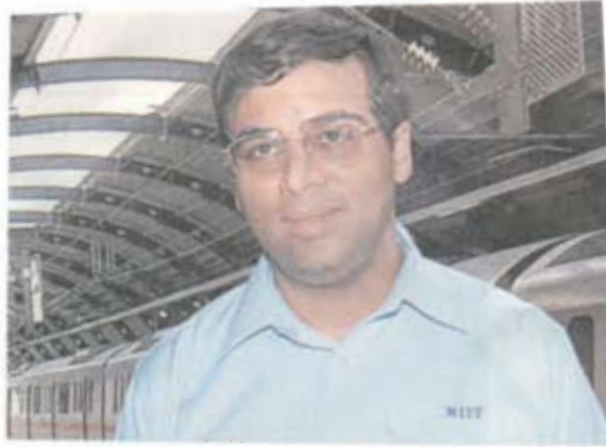
IN FOCUS Vishwanathan Anand