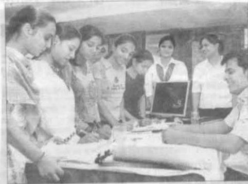
कैरियर : चंडीगढ़ सेक्टर-43 स्थित होटल पार्क ग्रैंड में शनिवार को आयोजित कैरियर फेस्ट में कंप्यूटर कोर्स के बारे में जानकारी हासिल करती छात्राएं।

The QuickSchool is currently used in 140 schools such as Delhi Public Schools and Somerville Public Schools. ♦