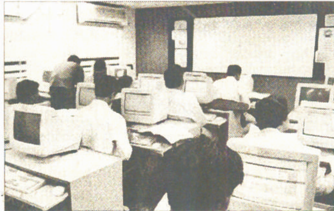
CHANGING TIMES: Companies like NIIT and Aptech are trying to re-jig their courses to beat recession blues

Companies like NIIT and Aptech are trying to re-jig their courses to beat recession blues. Short-term job-oriented training courses are the new mantra, a shift from the knowledge-based ones. "In the past two years, education programmes have moved from IT to global talent development and therefore we launched courses in train-