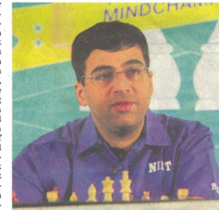
Indian chess Grandmaster and the current World Chess Champion Viswanathan Anand is popularising chess among schoolchildren

Chess has been touted for centuries as a way of educating the mind in preparation for life and has been seen as one of the most powerful educational tools available to strengthen a child's mind. A study on impact of playing chess, was carried out by the Foundation for Learning Research in Chess, which undertakes research and development work in inter-disciplinary field of infusing Chess-centered culture into schools, communities and their work environment. The report titled 'Developing Mind-Champions through Chess' provides an in-depth account of the impact of the MindChampions' Academy clubs on 11,000 schoolchildren across India. The study report was published in 2010. NIIT MindChampion Academy, a joint initiative with NIIT, is aimed at initiating children across India to the game. Indian chess Grandmaster and the current World Chess Champion Viswanathan Anand is an ambassador of this initiative and has been involved in spreading awareness about the game among schoolchildren in the country. In an interaction with J&C he talks about this sport-academic initiative. Excerpts: