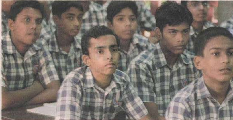
MAKE IT INTERESTING: New innovative methods.

The programme is a construction, demonstration, and exploration tool that adds a visual