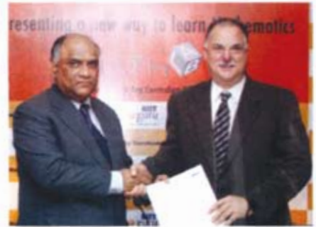
NIIT signs a MoU with Key Curriculum Press, USA to provide software for Math Labs that will be included in the NCERT and CBSE curricula

Under the proposal that has been presented to NCERT, CBSE and other schools, NIIT shall provide the initial investment of nearly Rs 4 to 8 lakhs that shall be required depend-