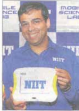
Chess champion & NIIT ambassador Viswanathan Anand launching the Mobile Science Lab.