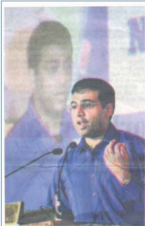
World chess champion Viswanathan Anand speaks at the launch of a product of NIIT's Mobile Science Lab in Bangalore on Thursday.

NIIT and Fourier Systems have entered into an alliance to make Mobile Science Lab available to students in India. Under the partnership, NIIT would make available technology-enabled learning solution to explore science through computer-aided experimentation, while Fourier Systems would offer NOVA 5000 Science data logger with a vast range of Science probes for capturing relevant data and several other innovative solutions for learning of science. UNI