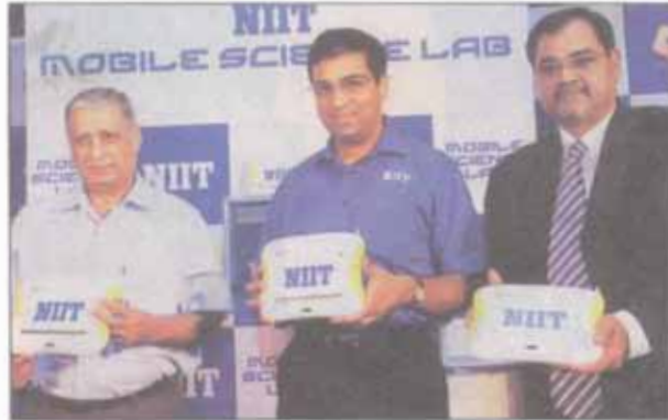
■ Chess champ Viswanathan Anand (centre) at the launch of a compact mobile lab for schools.