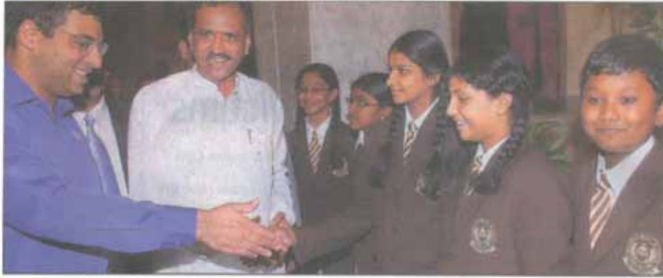
World chess champion Viswanathan Anand and primary and secondary education minister Vishweshwara Hegde Kageri interact with students at the launch of Mobile Science Labs in Bangalore