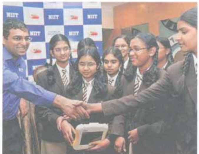
CHAMPION TALKS: Vishwanathan Anand interacting with school students at the inauguration of NIIT's mobile science lab on Thursday Vishwanathan Anand , world chess grandmaster

“In today's world, use of science and technology has become indispensable. Be it playing a game of chess or a student working in laboratories as a part of school work, knowledge and power of science and technology is a must.”