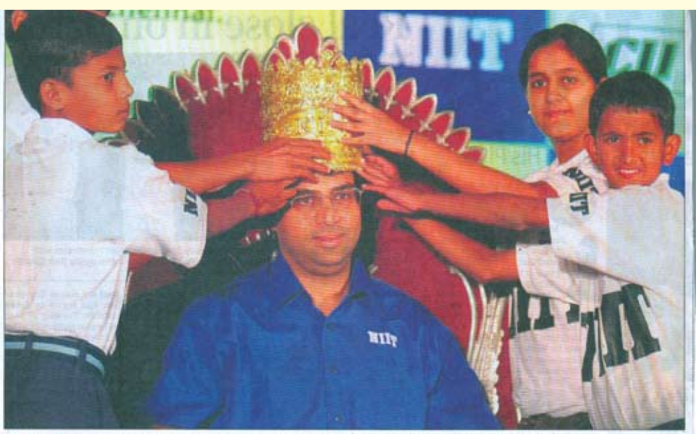
HAIL THE KING: Winners of an art competition place a crown on world chess champion Viswanathan Anand's head, in Chennal on Sunday